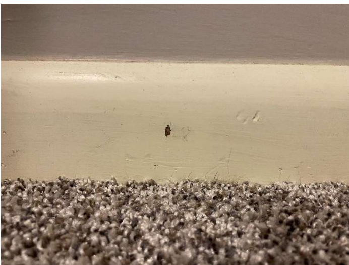
This is an example of a standard installation scuff